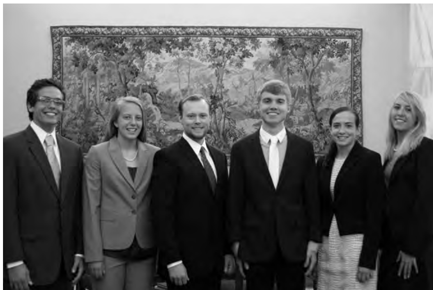
Presidential Fellows develop vital leadership skills serving in close partnerships with the College's senior leaders.

ECB425, 426 Internship I, II (2-4, 2-4) —Combines on-the-job work experience with related academic study. Must be prearranged and approved by instructor and Registrar's Office. Four credits maximum toward major. Prerequisite: minimum cumulative GPA of 2.50.